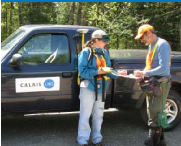
Vinton Cassidy, Mayor of Calais

“Frankly, a lot of us see LNG as a bridge to our energy future.”