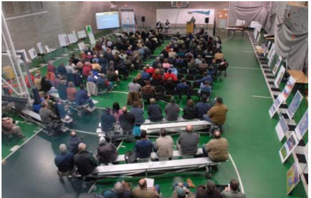
More than 240 people attended the March 24, 2009 public information meeting that was held at the Washington County Community College in Calais.